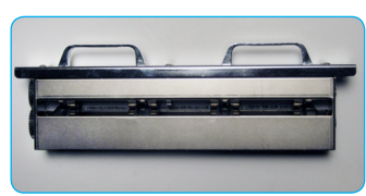
Easily-interchangeable cassette design