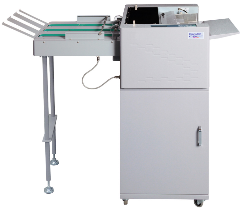
| CC-330 Card Cutter with optional conveyor |